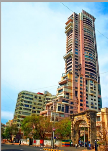
One of the pvt. buildings used for filming