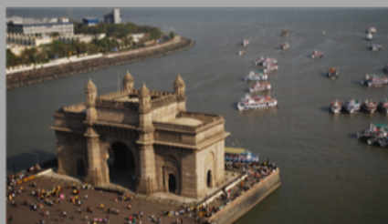
Gateway of India & Surrounding waters