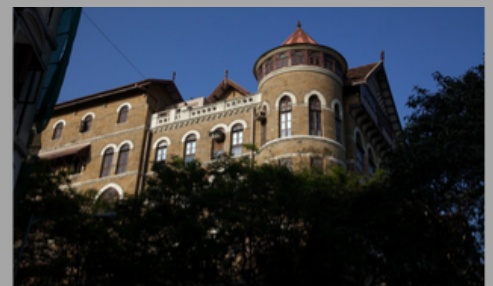
The Royal Bombay Yacht Club