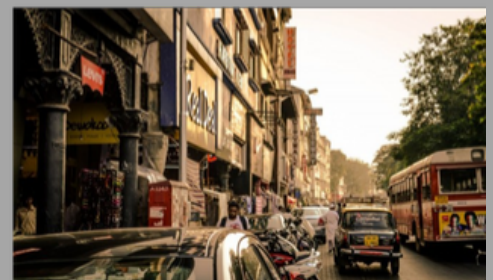
Colaba causeway market