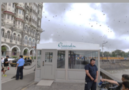
Restaurant set-up n front of Taj Mahal hotel for filming